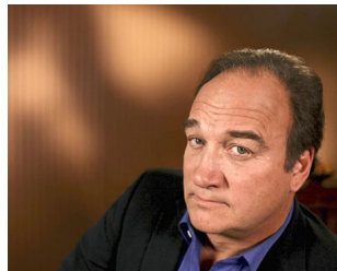
Jim Belushi champions gout treatment