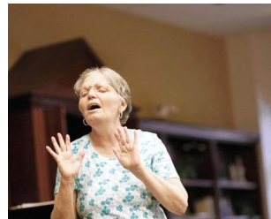
Younger onset Alzheimer's patients stay active