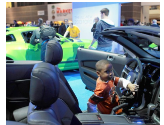
Chicago Auto Show: Muscle cars still have the power